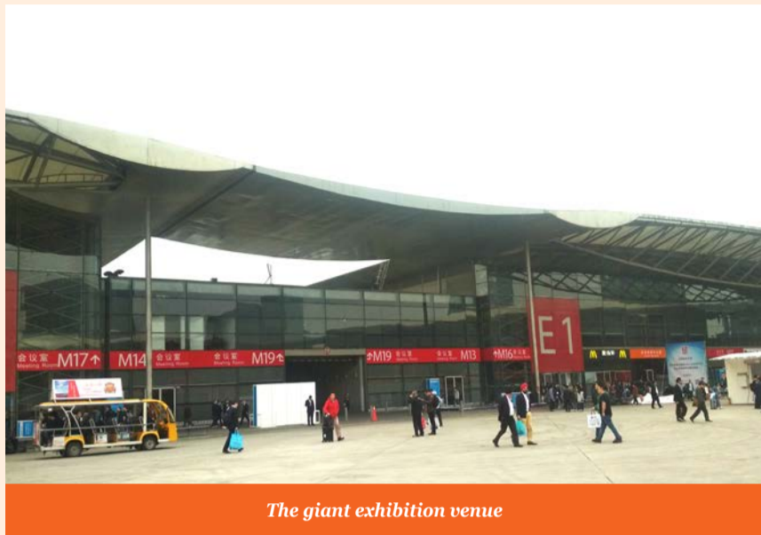
The giant exhibition venue